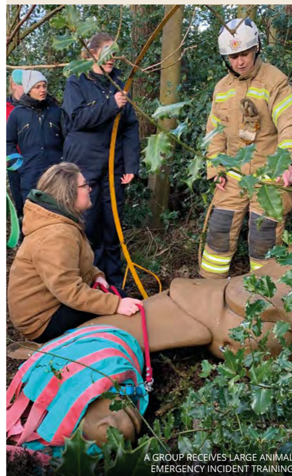
A GROUP RECEIVES LARGE ANIMAL EMERGENCY INCIDENT TRAINING

£4,000 and free venue hire to the Scottish Association of Young Farmers Clubs (SAYFC) in support of their Cultivating Leaders programme, which aims to develop and grow the skills of young leaders in the agricultural sector.