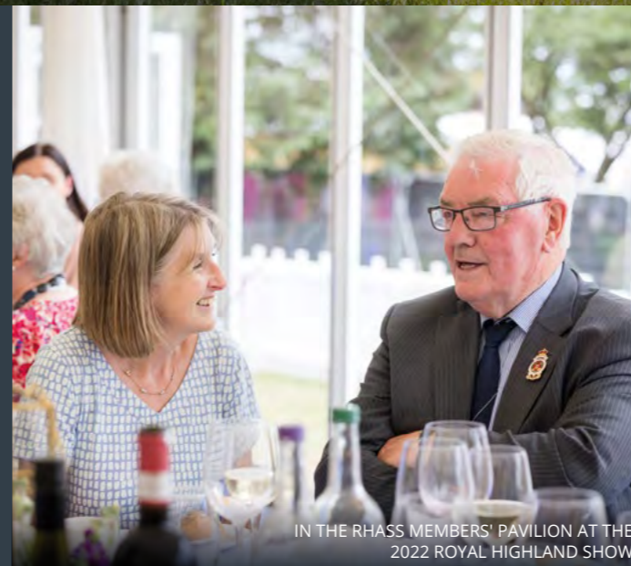
IN THE RHASS MEMBERS' PAVILION AT THE 2022 ROYAL HIGHLAND SHOW

Our founders' vision of a 'successful Society powered by its members, its people and its principles' defines how RHASS operates today. Values of Service, Quality, Value, Tradition and Trust have shaped the charity; building strong relationships with members, customers and suppliers.