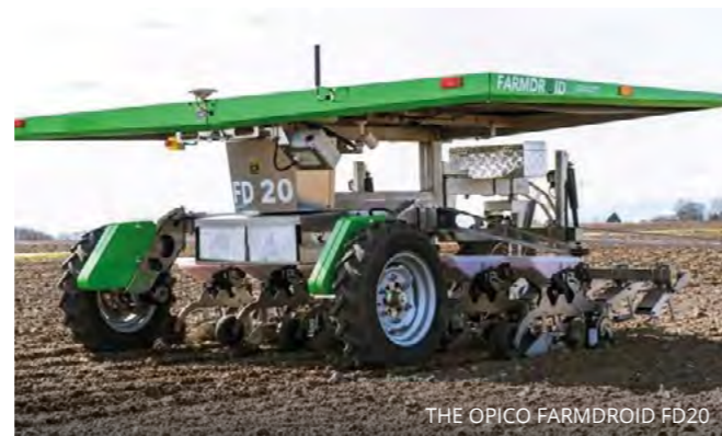
THE OPICO FARMDROID FD20

The Technical Innovation Awards encourage developers and inventors to keep striving for the improvement of the sector. This year, a trend towards automated farming was shown by multiple entries, including Opico, which was awarded a Silver for the FarmDroid FD20. The FarmDroid is the world's first fully automatic robot that both seeds and mechanically weeds. It is solar powered and uses GPS to precisely place each seed.