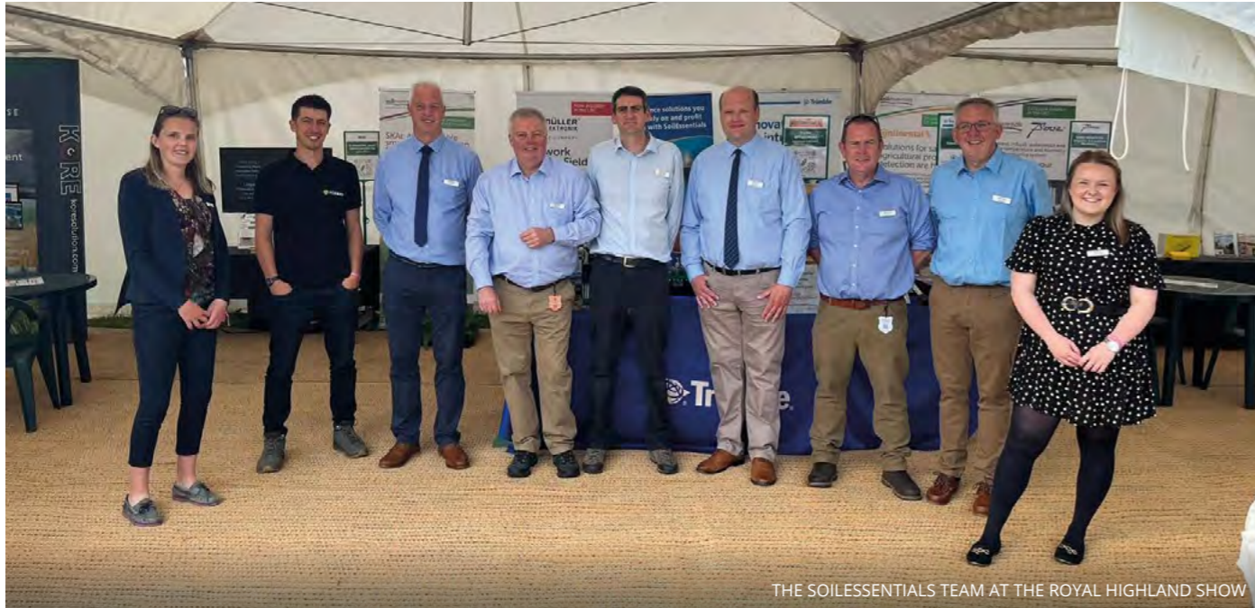
THE SOILESSENTIALS TEAM AT THE ROYAL HIGHLAND SHOW