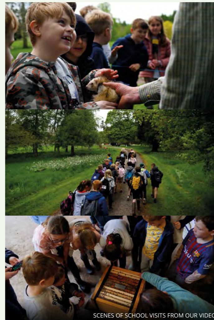
SCENES OF SCHOOL VISITS FROM OUR VIDEO