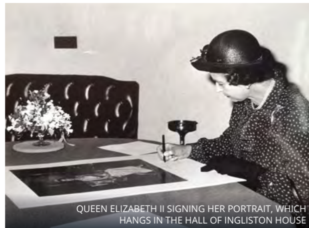
QUEEN ELIZABETH II SIGNING HER PORTRAIT, WHICH HANGS IN THE HALL OF INGLISTON HOUSE