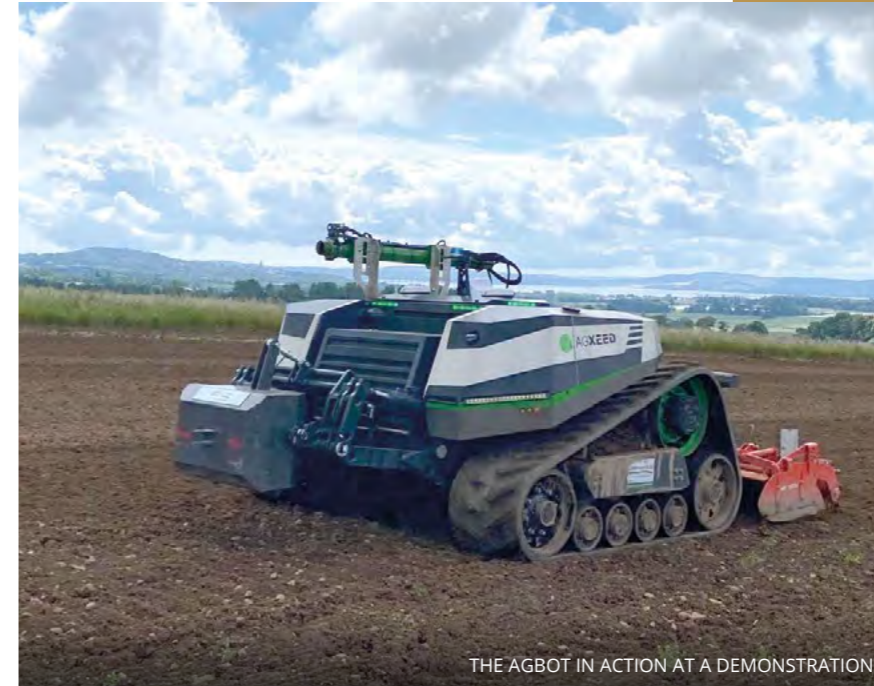
THE AGBOT IN ACTION AT A DEMONSTRATION