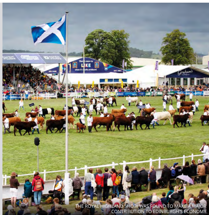
THE ROYAL HIGHLAND SHOW WAS FOUND TO MAKE A MAJOR CONTRIBUTION TO EDINBURGH'S ECONOMY

Watch out for further details of this report in the next Society magazine and in the run up to the 2023 Highland Show.