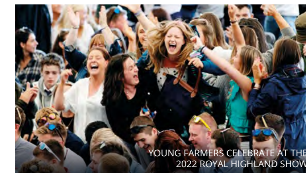
YOUNG FARMERS CELEBRATE AT THE 2022 ROYAL HIGHLAND SHOW

A fund of up to £3,000 to support Scottish Shows to attend the ASAO conference held at the Pavilion at Ingliston from 4th to 6th November. In partnership with the Association of Shows and Agricultural Organisations (ASAO), RHASS hosted the first full annual conference since 2019. ASAO is the body that represents agricultural shows and organisations across the UK and their aim is to promote agriculture, horticulture and the countryside through events and to encourage and share best practice between agricultural societies and related organisations. The conference attracted more than 100 delegates from 40 UK Shows over the three days, including the Balmoral, Great Yorkshire and Royal Welsh.