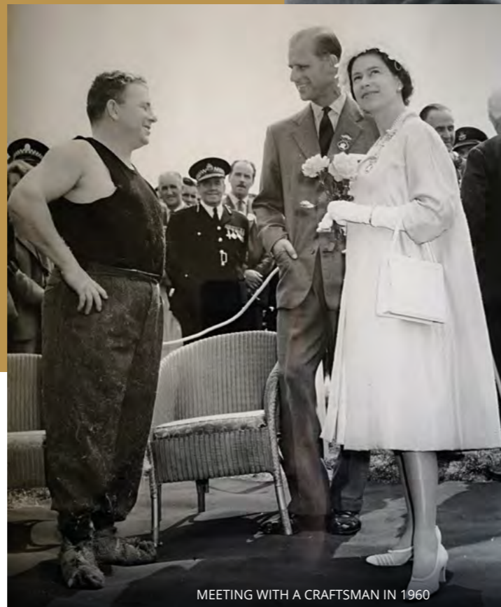
MEETING WITH A CRAFTSMAN IN 1960