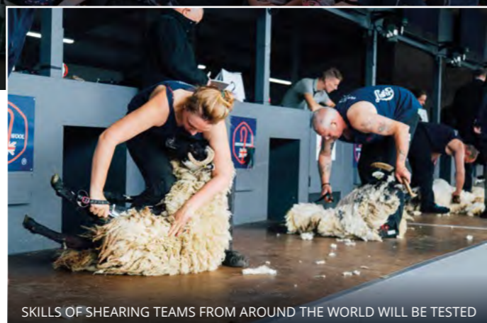
SKILLS OF SHEARING TEAMS FROM AROUND THE WORLD WILL BE TESTED

"There is no better stage than the Royal Highland Show to celebrate the amazing skills of competitors at the Golden Shears. Scotland has a long and renowned heritage of sheep farming and woolhandling, so it is fitting that the Show will host this prestigious competition."