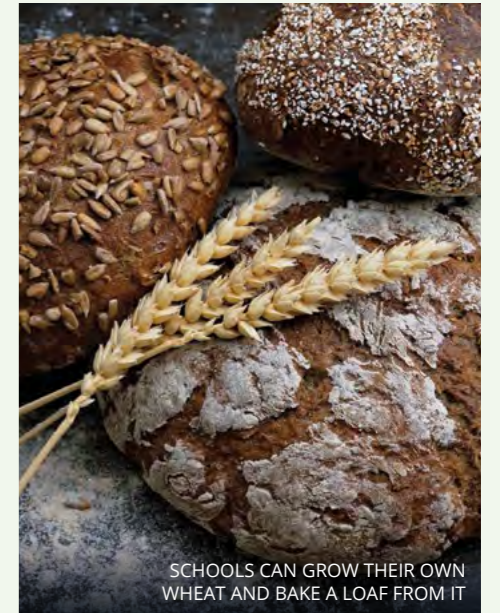
SCHOOLS CAN GROW THEIR OWN WHEAT AND BAKE A LOAF FROM IT

If you or anyone you know would like to get involved, please head to rhet.org.uk/golwakelet to find out more.