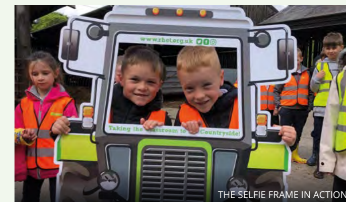
THE SELFIE FRAME IN ACTION!

For more information, please contact rhetinfo@rhass.org.uk