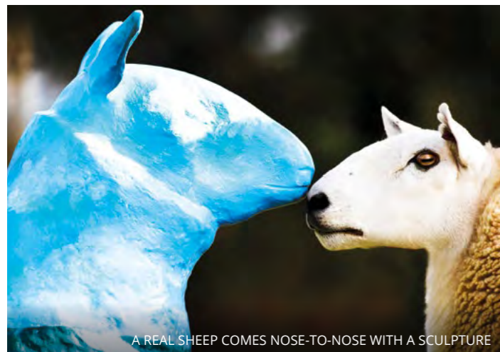
A REAL SHEEP COMES NOSE-TO-NOSE WITH A SCULPTURE